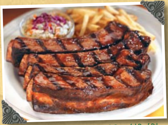
Tony's Bountiful Beef Ribs

NEW Pirate! Sweet and spicy sauce with orange and crushed pineapple with hot pepper and coconut. A real taste of the Caribbean!