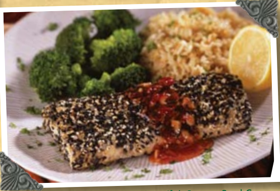
Swordfish Sesame Seed Crust

Two grilled shrimp skewers with bell peppers, red onion and basted with garlic butter and Tony's special seasoning. Served with your choice of two side items £9.95