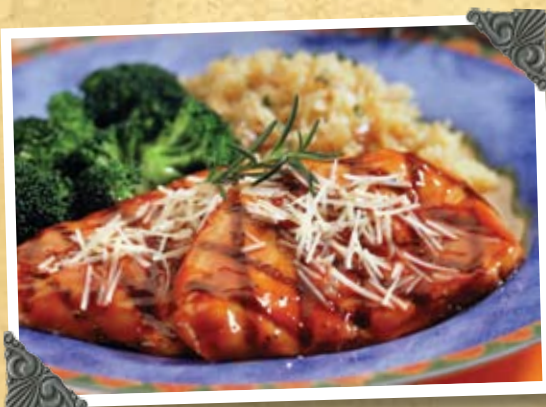
Roasted Garlic & Rosemary Chicken