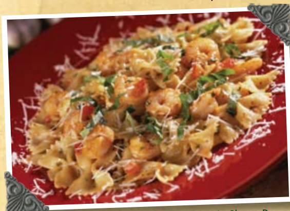
Garlic Shrimp Pasta

Tender shrimp tossed in garlic butter, tomato pesto, basil and Parmesan cheese with bowtie pasta. £9.95