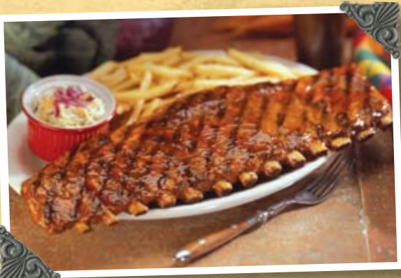
St Louis Ribs

Original™, Carolina Honeys™, Blue Ridge Smokies™ and Tony Roma's Red Hots™ £14.95