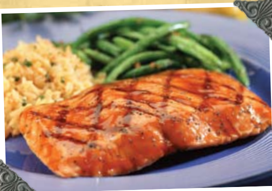
Grilled Salmon with Carolina Honeys™ sauce

Traditional beer battered Haddock, crisp fried to a golden brown. Served with fries, coleslaw and tartare sauce. £7.95