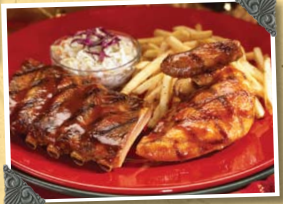
Rib & Chicken Combo Dinner