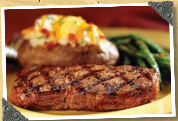
Flame Grilled New York Strip Steak

A 16oz, mouthwatering T-Bone cut of fillet and sirloin steak. £16.95