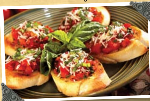
Tomato Pesto Bruschetta