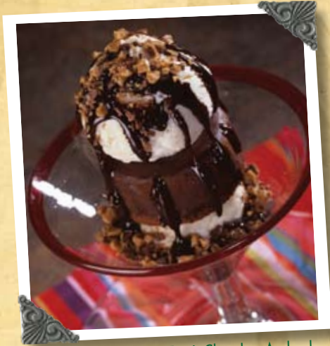
Tony's Chocolate Avalanche