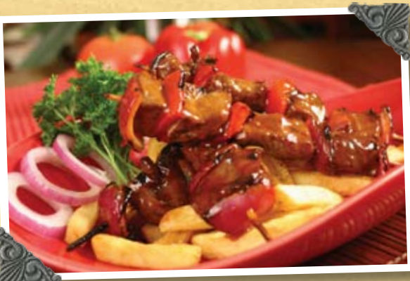
Beef & Lamb Skewers

Grilled lamb and mint burger served with feta cheese, shredded lettuce, tomato slices, red onion, pickle and our mint yoghurt dip on the side. Served with fries. £8.95