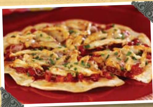
Barbecue Chicken Flatbread

A flour tortilla with pulled chicken, Monterey Jack cheese, tomato salsa and topped with Tony's Original Barbecue Sauce™. £5.95