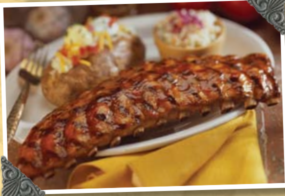
Original Baby Back Ribs