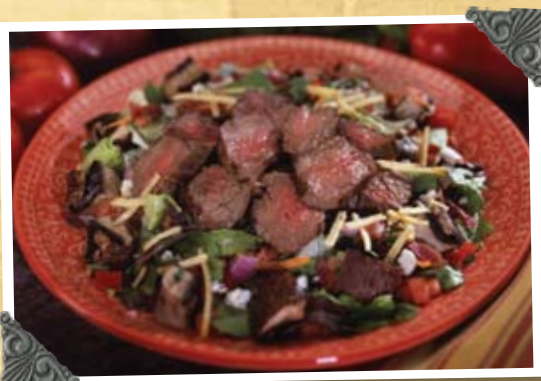
Tenderloin & Portobello Salad

Grilled, seasoned beef tenderloin and Portobello mushrooms with mixed greens, onions, tomato pesto and blue cheese crumbles. Served with balsamic and red wine dressing. A real salad meal! £10.95