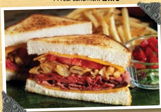
Sirloin Cheddar Grill

Tender sirloin sliced thin and piled high on farmhouse toast and topped with Cheddar cheese, tomato slices, crisp onions and Tony's BBQ mayonnaise. A real sandwich! £9.95