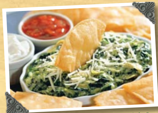
Spinach & Artichoke Dip

V Available for vegetarians without bacon.